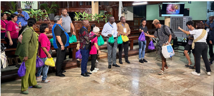
CCP Forum attendees help the Knox UMC Homeless Ministry distribute meal packages to people experiencing food insecurity in Manila.