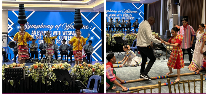
CCP Forum attendees engage in local recreation at a cultural show at Philippine Christian University.