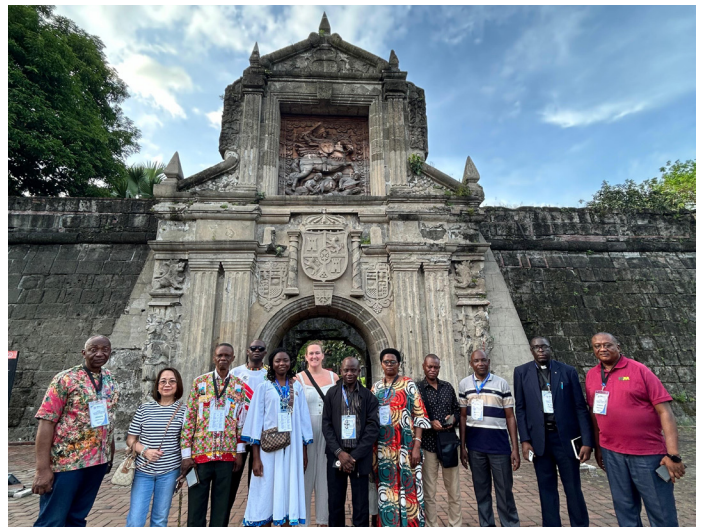
After a week of informative sessions, CCP Forum attendees enjoy camaraderie during a tour of Intramuros.