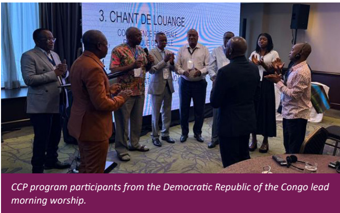
CCP program participants from the Democratic Republic of the Congo lead morning worship.