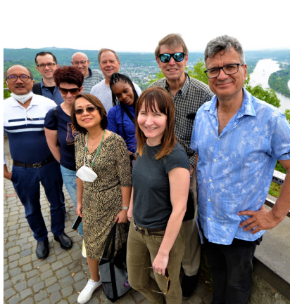
Central Conference Pensions Officers Forum: Königswinter, Germany—May 2022