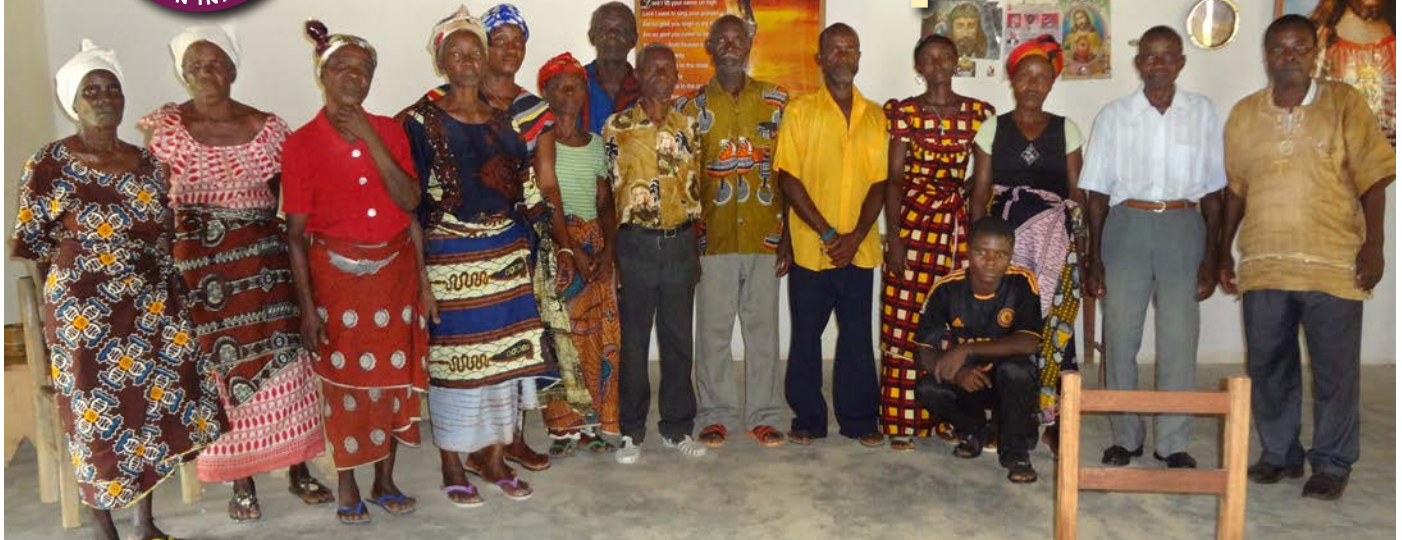
Pictured here are some of the retired pastors and surviving spouses in Liberia who are receiving CCPI pension support.