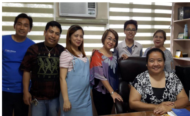
The staff at the Philippines Central Conference Pension Office

“This moving experience was a perfect reminder that we are united in a common goal through CCP.”