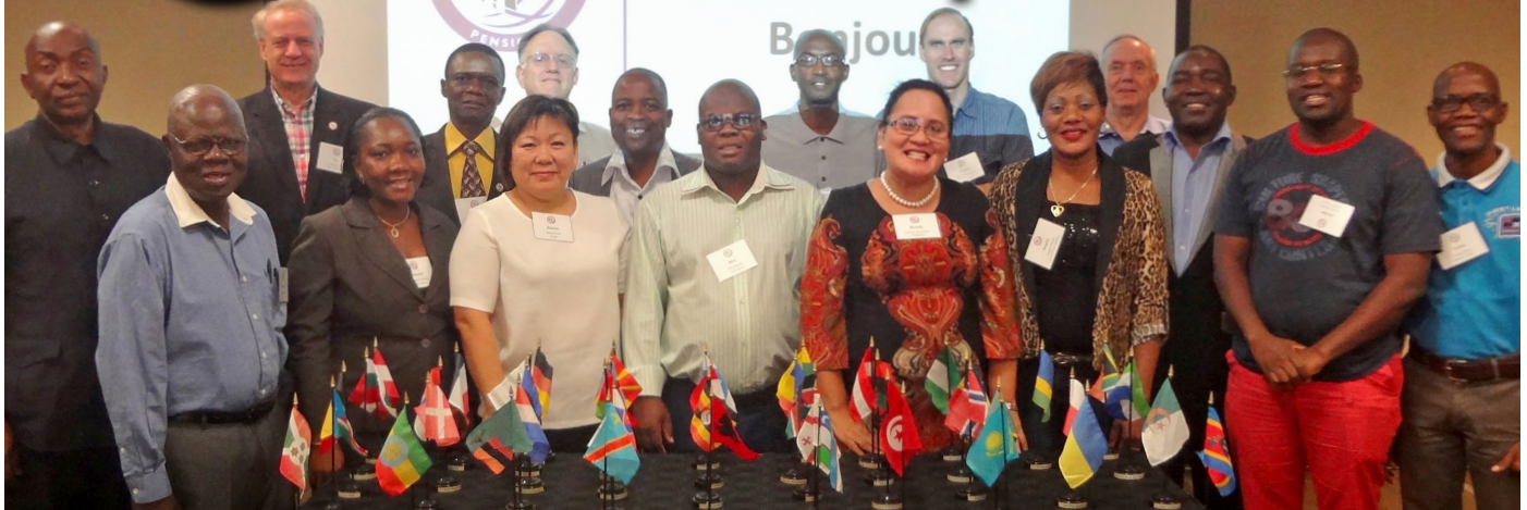
CCBOs met in Johannesburg