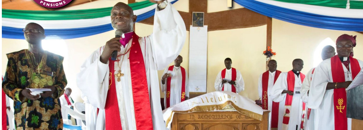
Bishop Yambasu, Sierra Leone (UMNS)